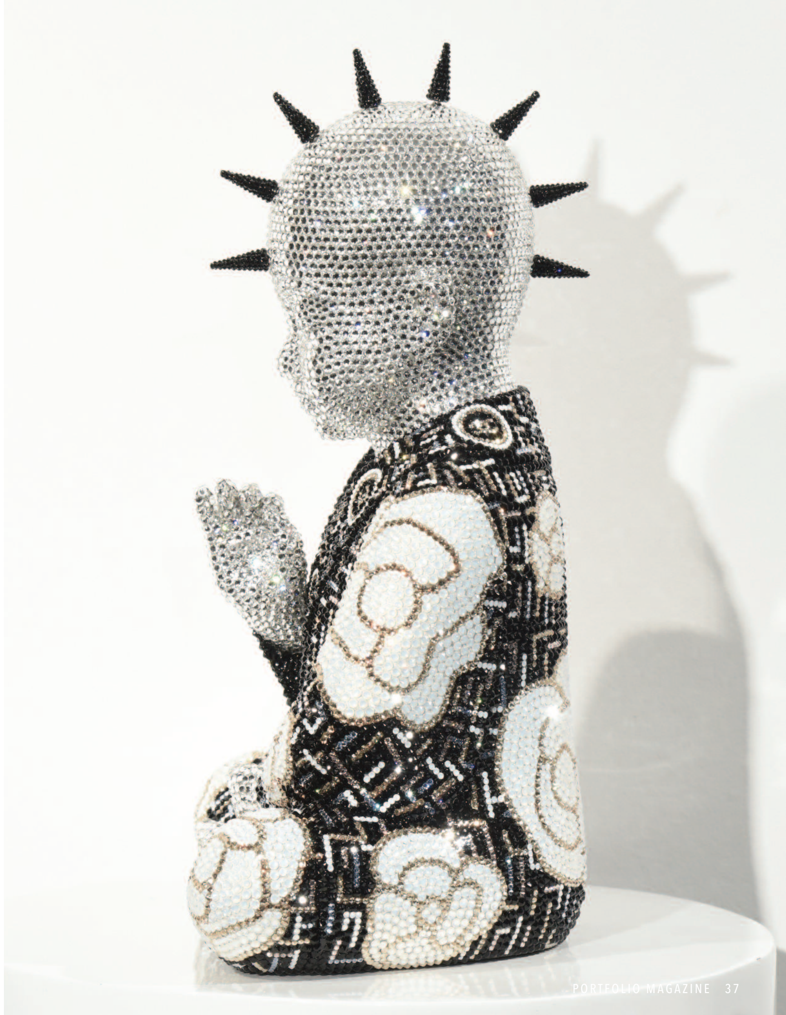
Opposite page: PUNK BUDDHA "KARL" feat. Chanel Fiberglass sculpture, acrylic paint, encrusted with more than 100,000 SWAROVSKI crystals, crystalized spikes. Size: H: 38 inch x W: 32 inch x D: 26 inch Inspired by: Chanel