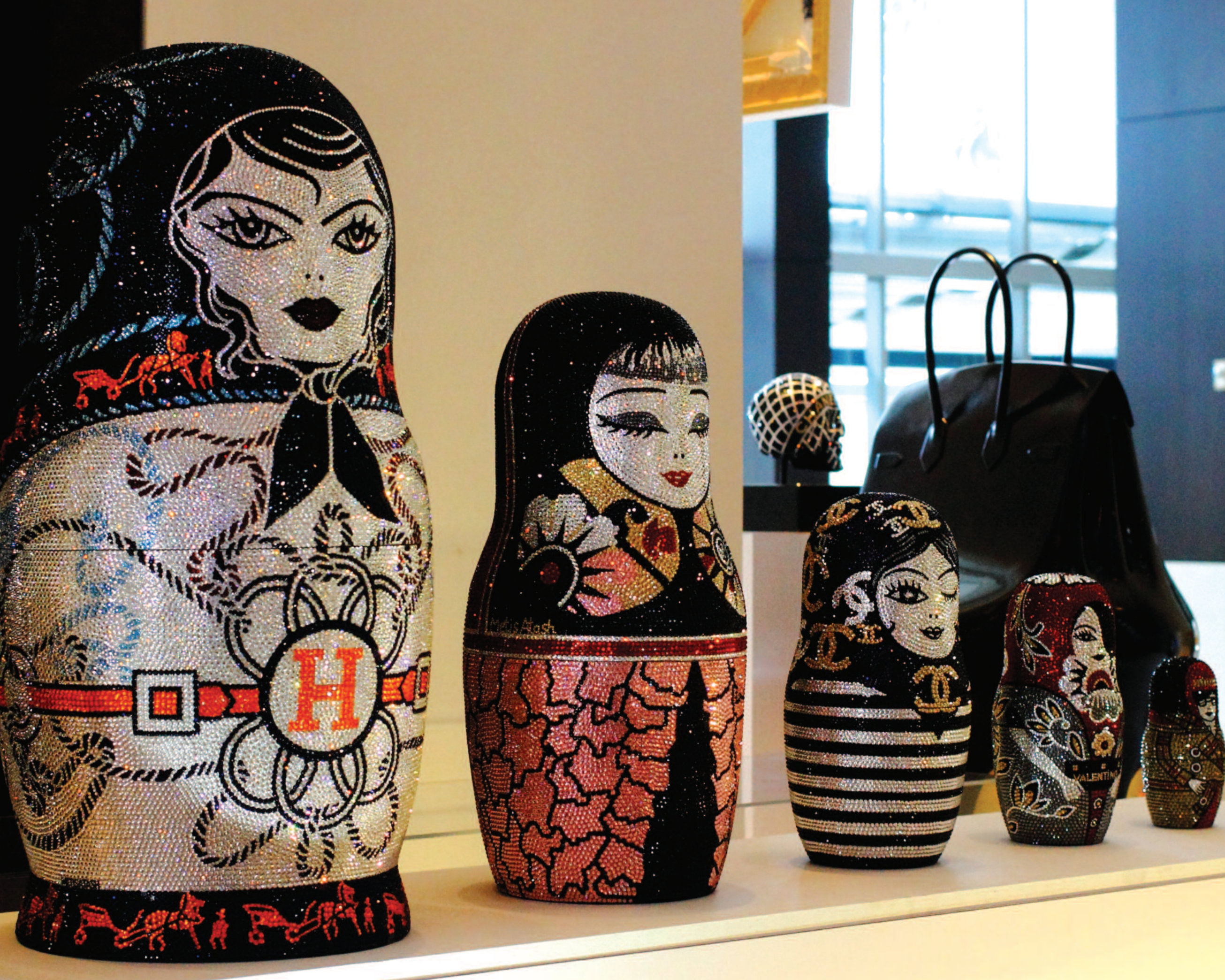
RUSSIAN DOLLS "FASHION NAMASTE" Fiberglass sculptures, set of 6 dolls, acrylic paint, encrusted with more than 250,000 SWAROVSKI crystals Sizes: H: 36 inch, H: 24 inch, H: 16 inch, H: 12 inch, H: 8 inch, Inspired by: Hermes, Alexander McQueen, Chanel, Burberry, Valentino and Roberto Cavalli